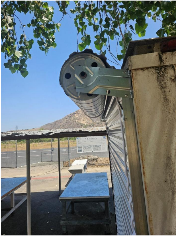
New shed door