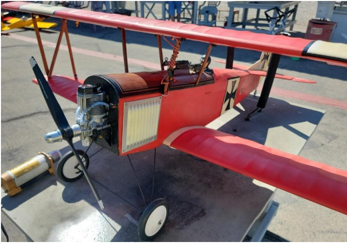
Lyle Blacks resurrected Fokker D.VII sounds and flies beautifully with a YS 1.20.