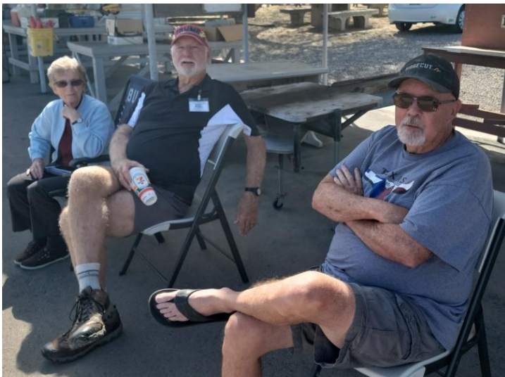
More of the gang.