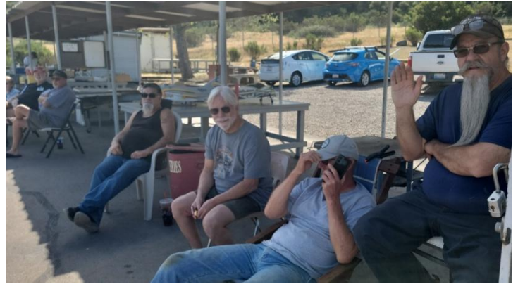
Part of the gang.